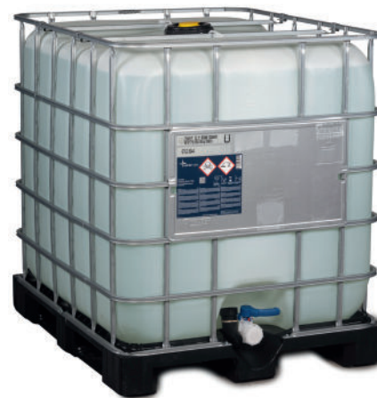
1200 kg IBCs