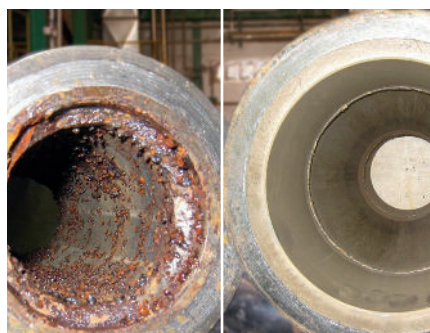
Photo: Result with Bath 302 before and after circulation pickling