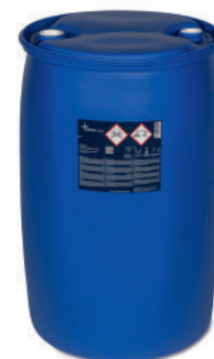
240 kg drums