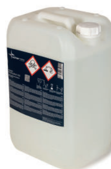
33 kg drums