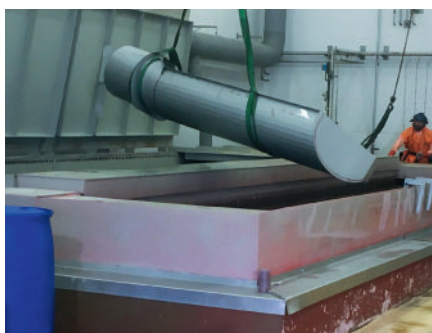
Photo: Immersion pickling with Bath 302